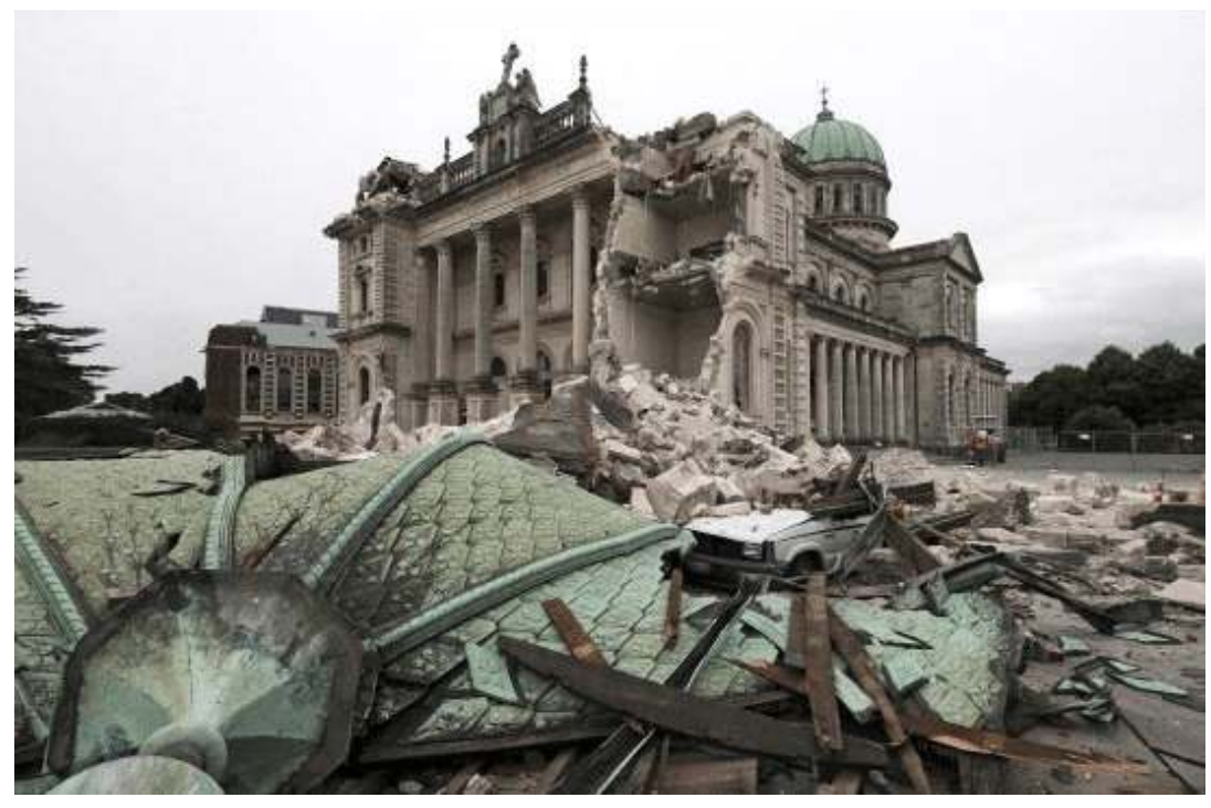
Christchurch Basilica (Roman Catholic) - Both Bell Towers Destroyed