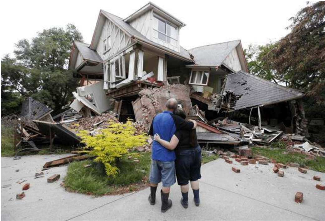
Collapse in Christchurch

The Spirit has been testifying that it is time for all saints to get their houses in order. Those who do not will certainly suffer loss.