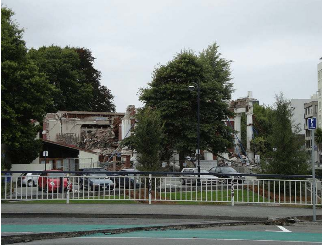
Oxford Street Baptist Church After Quake