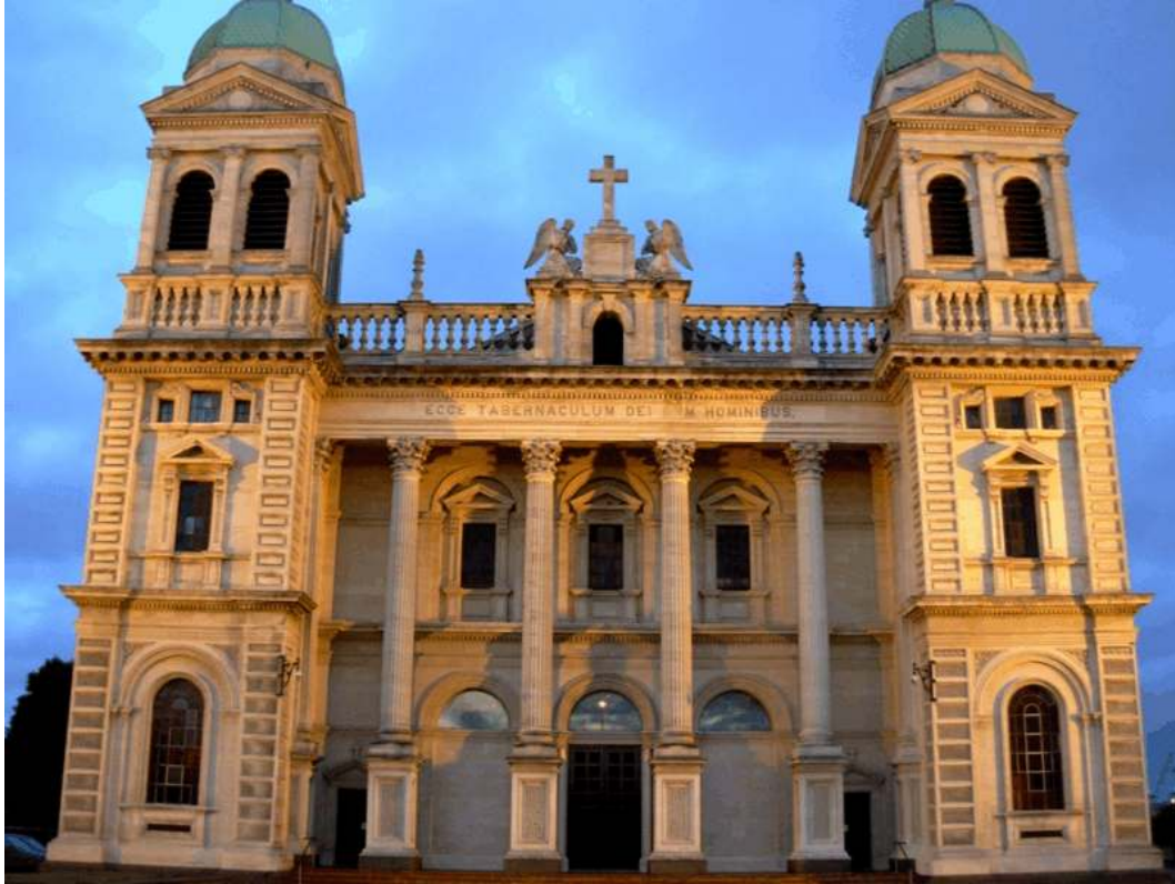
Christchurch Basilica Before Earthquake