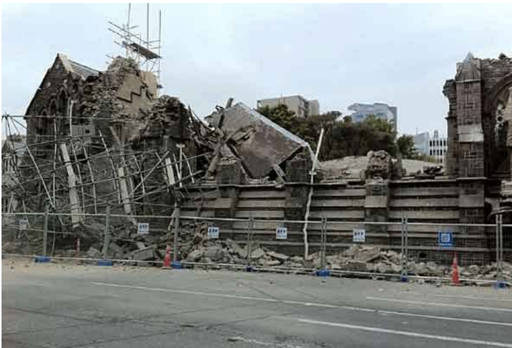
Unidentified Church - Destroyed by Quake