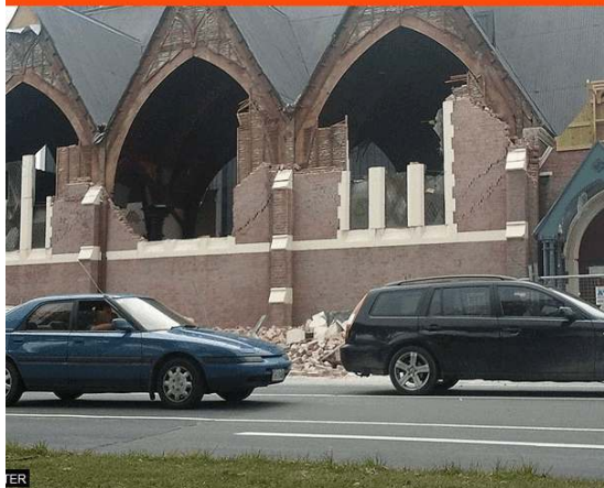
Knox Church - Presbyterian - Before and After