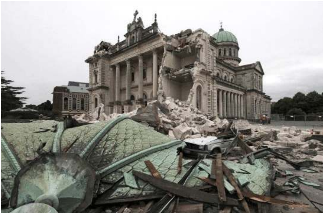
Christchurch Basilica After Yesterday's Earthquake