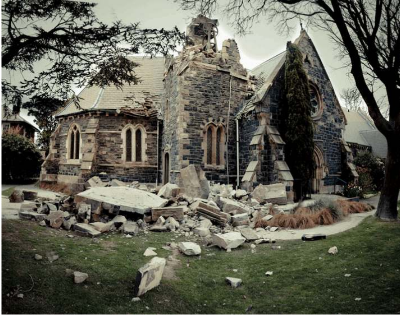
St. John's Anglican Church After Quake