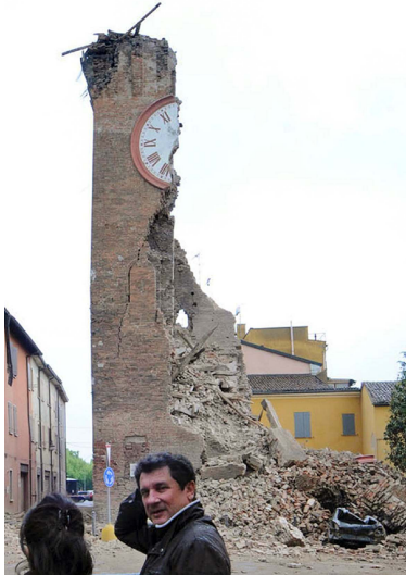
Image from the Quake in Italy

Last year in February there was a devastating earthquake in Christchurch where many historic church buildings were damaged or destroyed. This occurred along the Ring of Fire. Now we have two events, one in the heavens, and one on the Earth, that are bringing forth the same testimony.