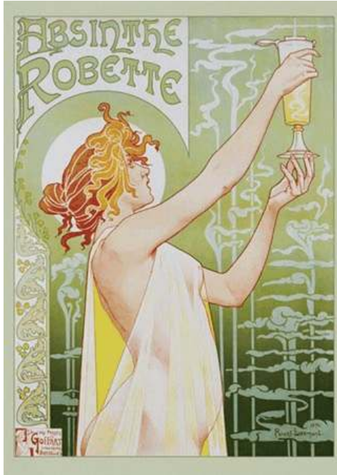
Absinthe Poster from 1896