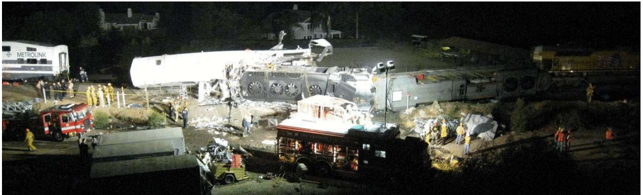
Metrolink 111 Train Crash

Metrolink 111 had begun its run at UNION Station in Los Angeles. It crashed full speed into a UNION Pacific freight train traveling in the opposite direction. The results were horrendous as dozens were killed and many more were seriously maimed and injured.